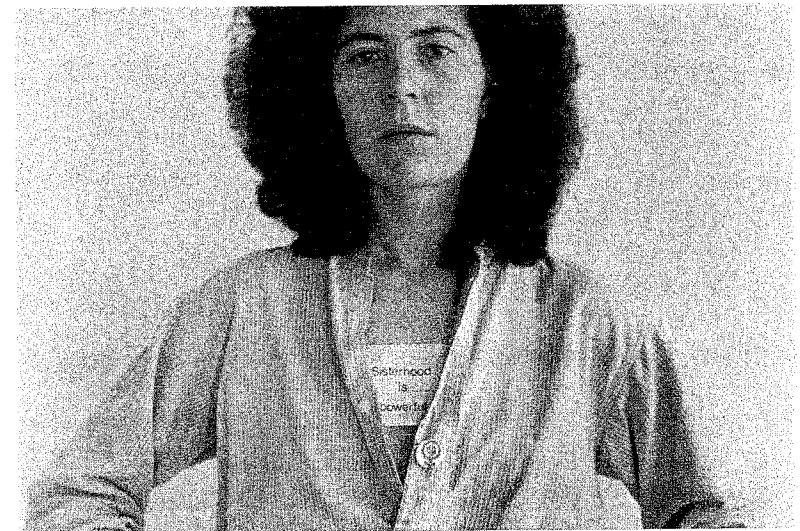
Woman's Identity 4