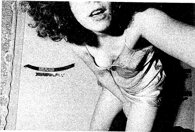
Woman's Identity 2