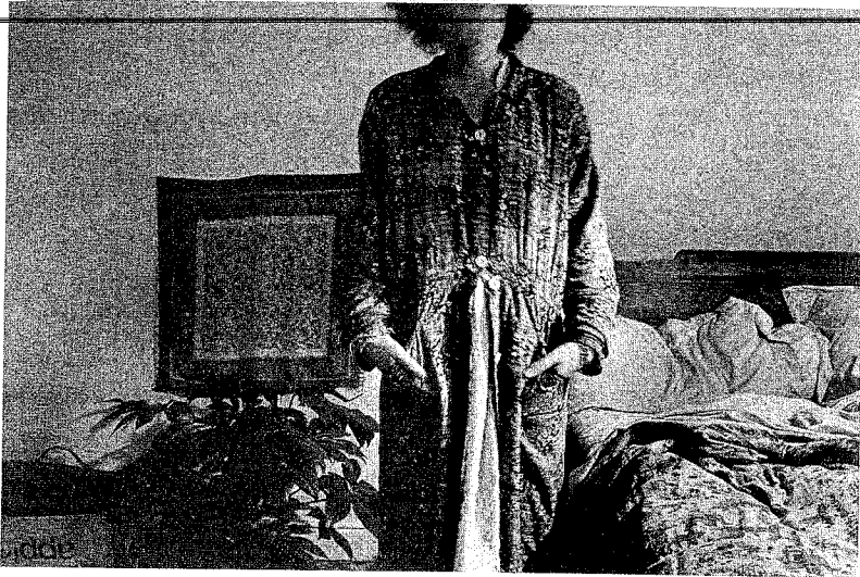
Woman's Identity 1