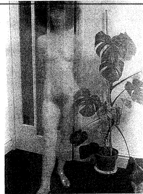
Woman's Identity 3